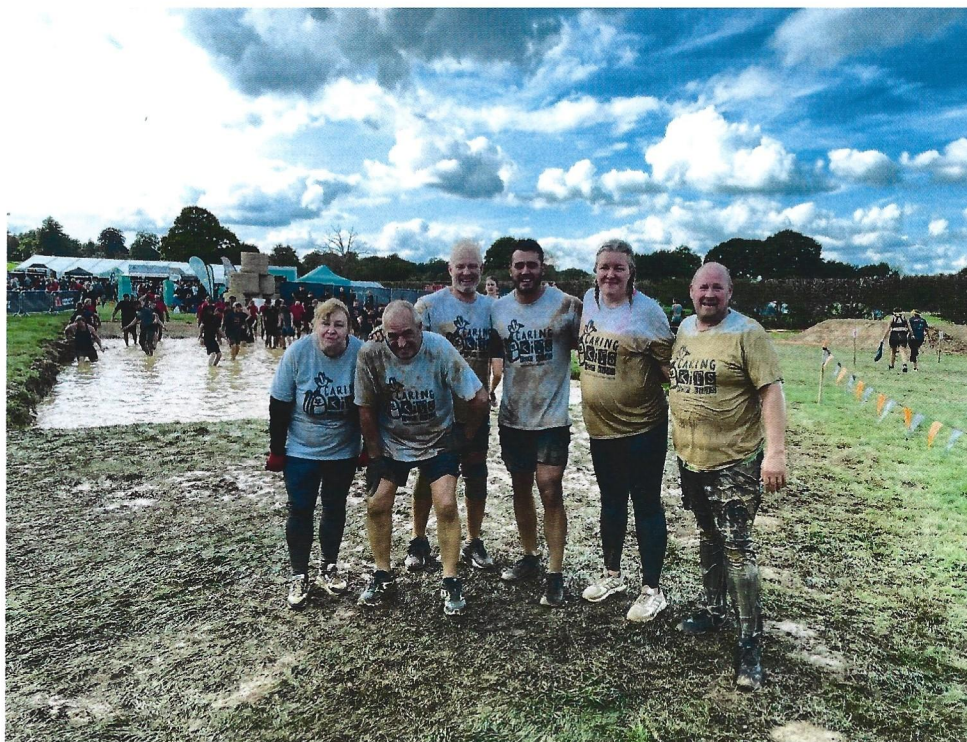
5km London South Tough Mudder

by fundraising over £3000 from the general public. We would like to thank all the donors, volunteers and Alstom employees whose generosity and hard work this past year helped us deliver kits to St George's University Hospital, North Middlesex University Hospital and Royal Manchester Children's Hospital. We really couldn't have achieved what we have without you!